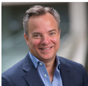
MARK B. MCCLELLAN, MD, PhD, DIRECTOR AND ROBERT J. MARGOLIS, MD, PROFESSOR OF BUSINESS, MEDICINE AND HEALTH POLICY

Dr. McClellan is a doctor and an economist whose work has addressed a wide range of strategies and policy reforms to improve healthcare, including payment reforms to promote better outcomes and lower costs, methods for development and use of real-world evidence, and approaches for more effective drug and device innovation.