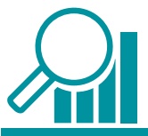
Figure 2: Recommendations for Data Sharing and Analytics

To build a data system that can deliver timely, useful data to practitioners that drives high performance in new value-based payment models, state data agencies should: