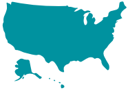
Figure 4: Supporting Policies for Payment Reform

Given their unique challenges and capabilities, states should consider multiple supporting policies to encourage payment reform and implementation.