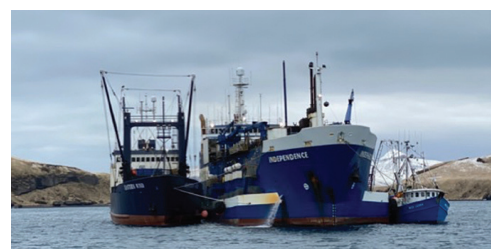
Over 200 people were vaccinated as part of EAT's on-the-vessel vaccine program in Akutan. This was part of an effort to vaccinate approximately 4,000 people in a four-day period.

Tribal communities and health centers used a hyper-localized approach for allocation and vaccination goals from the beginning of the vaccine roll-out. The monthly vaccine allotment and tribal sovereignty provided flexibility to determine priority populations and allocate vaccines appropriately to each tribes' needs. Because of Alaska's unique geography and the larger batches of vaccines available due to the monthly allotment, many tribal communities chose to focus on distributing vaccines to elders and multi-generational households first, rather than focus on a tiered risk approach. This