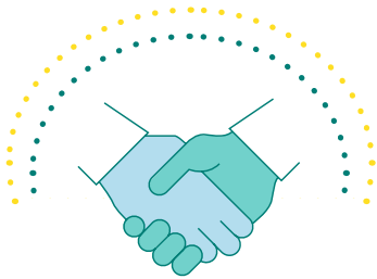
PARTNERSHIPS AND TRUST