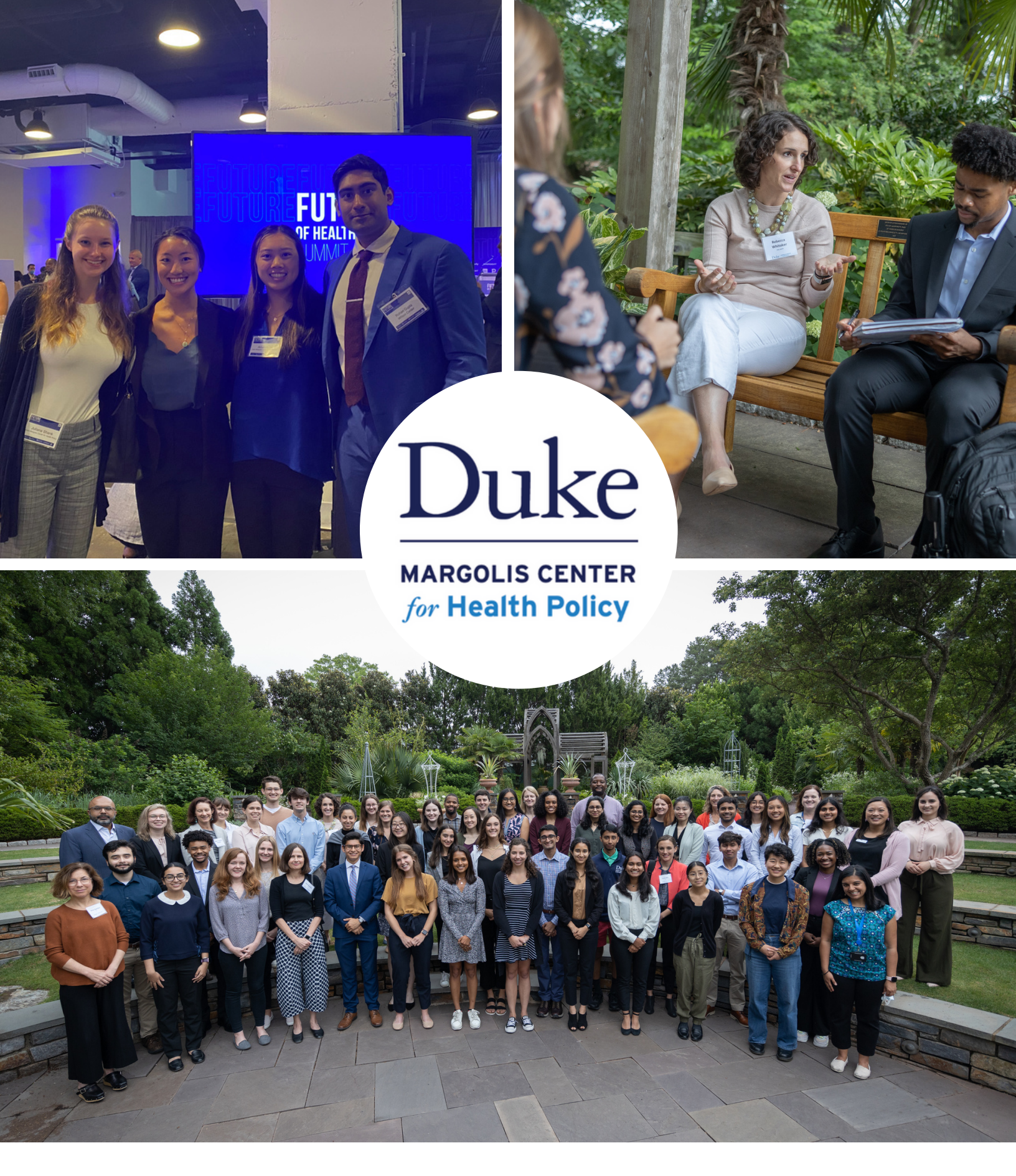
Duke- Margolis Summer Experience May - July 2023